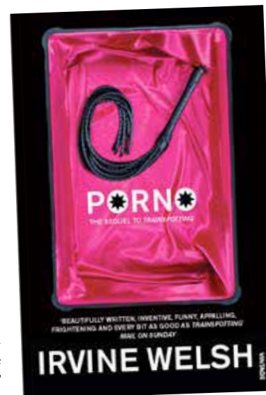
CLOCKWISE FROM TOP LEFT: RENTON ON THE RUN; PORT O’ LEITH PUB; PORT SUNSHINE ITSELF; TRAINSPOTTING’S SMUTTY SEQUEL; THE KITCHEN

While bemused locals skulk past, Bell reads from Trainspotting ’s penultimate chapter, in which Renton and the psychotic Begbie pass through the station, now a “barren, desolate hanger”, and are accosted by a cackling tramp. “What yis up tae, lads?” he asks. “Trainspotting, eh?” The image of wastrels awaiting a gravy train that’s never going to come is a powerful ►