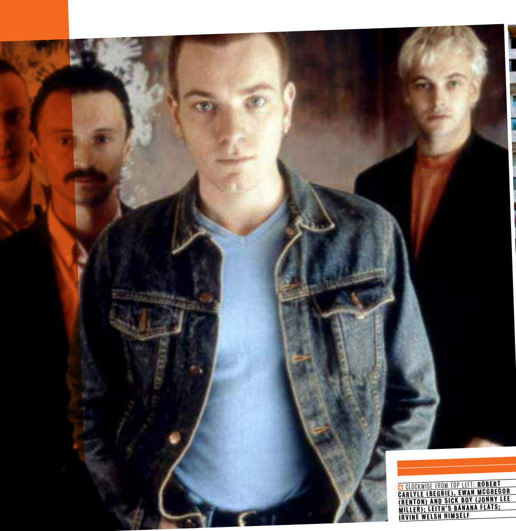
★ CLOCKWISE FROM TOP LEFT: ROBERT CARLYLE (BEGGIE), EWAN MCGREGOR (RENTON) AND SICK BOY (JONNY LEE MILLER); LEITH'S BANANA FLATS; IRVINE WELSH HIMSELF